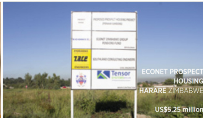
ECONET PROSPECT HOUSING HARARE ZIMBABWE