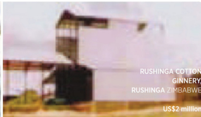
RUSHINGA COTTON GINNERY, RUSHINGA ZIMBABWE