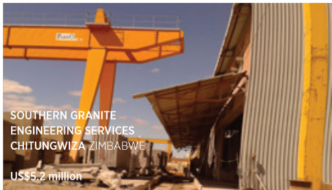
SOUTHERN GRANITE ENGINEERING SERVICES CHITUNGWIZA ZIMBABWE