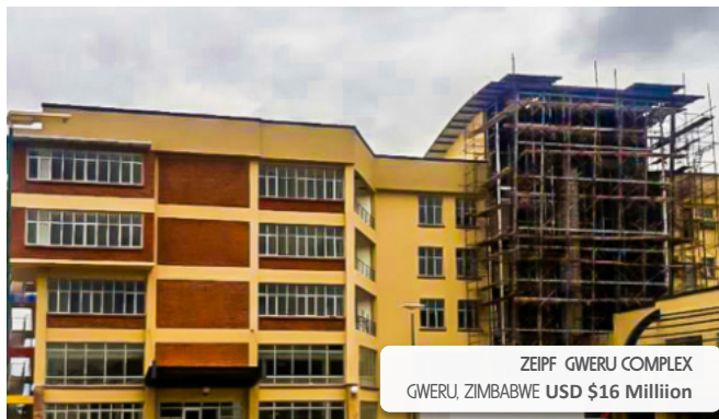
ZEIPF GWERU COMPLEX GWERU, ZIMBABWE USD $16 Million