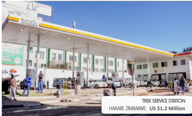
TREK SERVICE STATION HARARE ZIMBABWE, US $1.2 Million