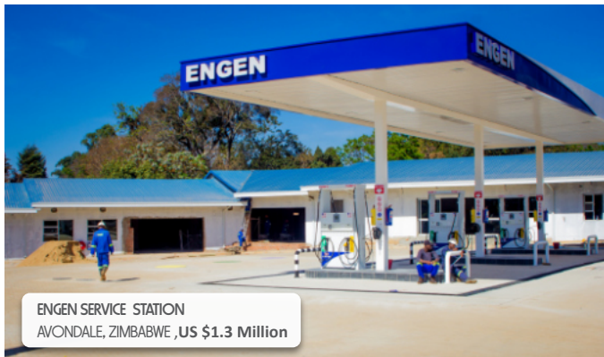
ENGEN SERVICE STATION AVONDALE, ZIMBABWE, US $1.3 Million