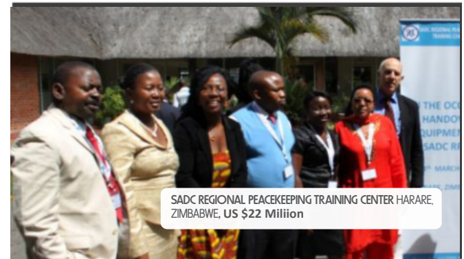
SADC REGIONAL PEACEKEEPING TRAINING CENTER HARARE, ZIMBABWE, US $22 Million