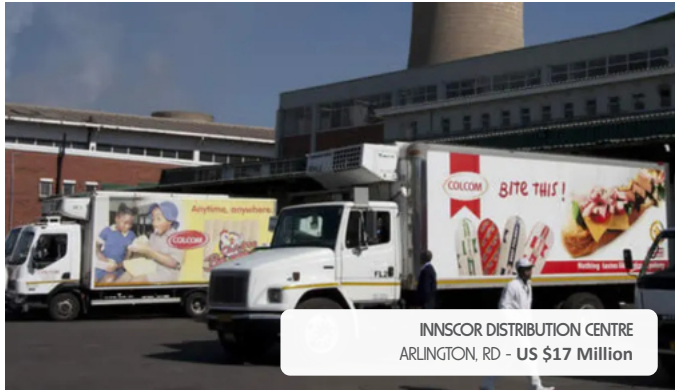
INNSCOR DISTRIBUTION CENTRE ARLINGTON, RD - US $17 Million