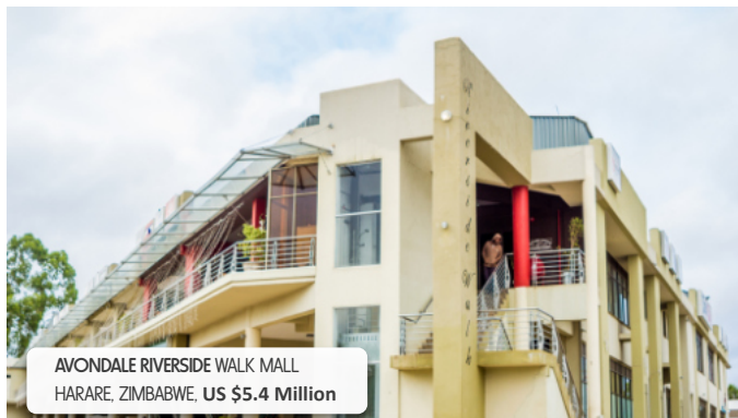
AVONDALE RIVERSIDE WALK MALL HARARE, ZIMBABWE, US $5.4 Million