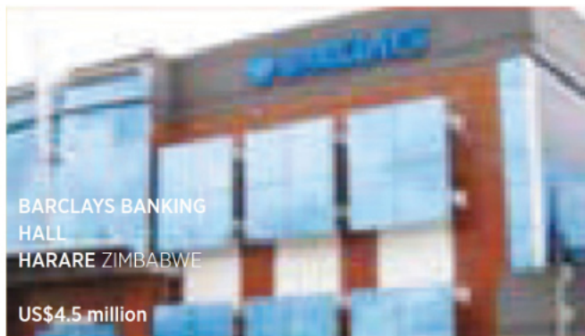
BARCLAYS BANKING HALL HARARE ZIMBABWE