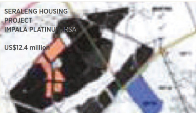
SERALENG HOUSING PROJECT IMPALA PLATINUM, RSA