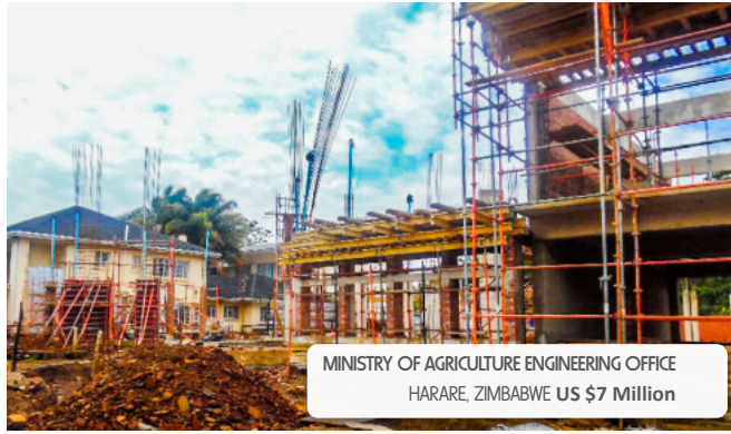
MINISTRY OF AGRICULTURE ENGINEERING OFFICE HARARE, ZIMBABWE US $7 Million