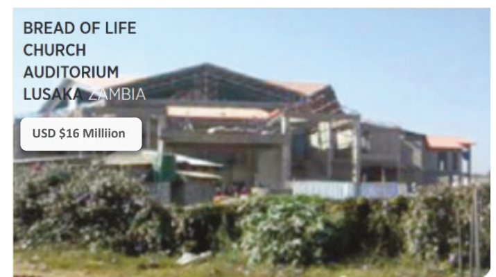
BREAD OF LIFE CHURCH AUDITORIUM LUSAKA, ZAMBIA USD $16 Million