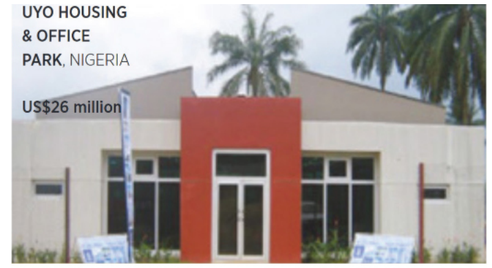
UYO HOUSING & OFFICE PARK, NIGERIA US$26 million